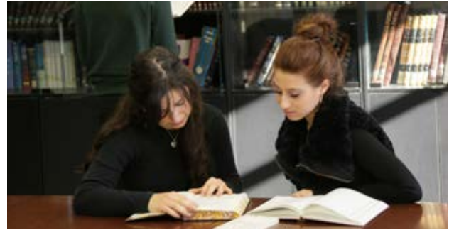
Diving into the words of Torah in our well-stocked library.

The Israel trip! They took such good care of us and made sure we had everything we needed. The history