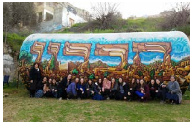
Holy Land Homeland! An incredible time.